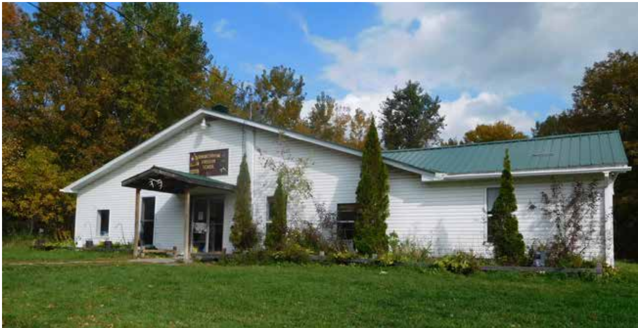
Akwesasne Freedom School.

Eventually the blockade ended, the encampment was abandoned, and a slow healing process began. 15 However, the school remained. Today, it is located in a wooded grove near the original protest site, with an enrollment of about sixty students. The schoolhouse is a simple frame building that, like a traditional longhouse, is oriented east to west with doors on either end. Operating without federal or state funding, and reluctant to impose burdensome tuition on parents, it remains a modest institution that still relies on support from outsiders; Quakers, in particular, have adopted the school as a project. Several foundations have, at various times, also provided funding.