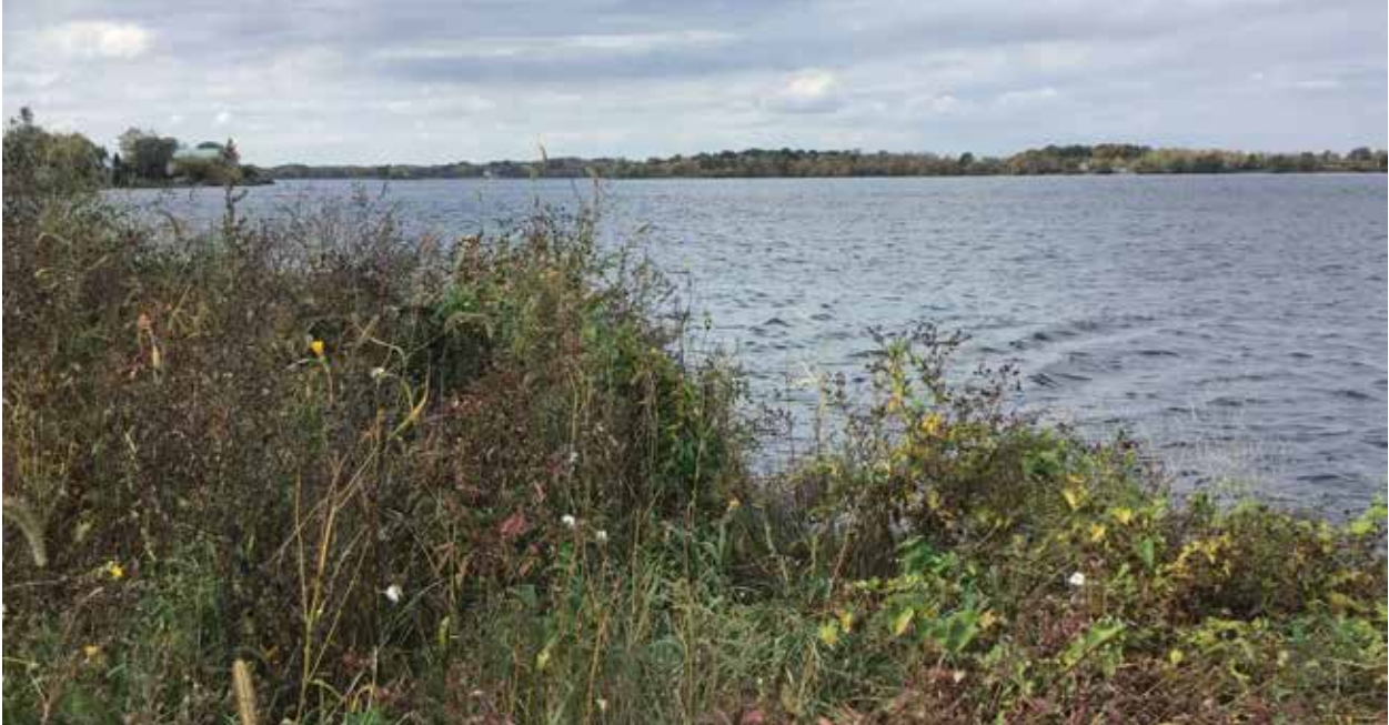
The St. Lawrence River, viewed from the south shore, in the reservation town of Akwesasne.